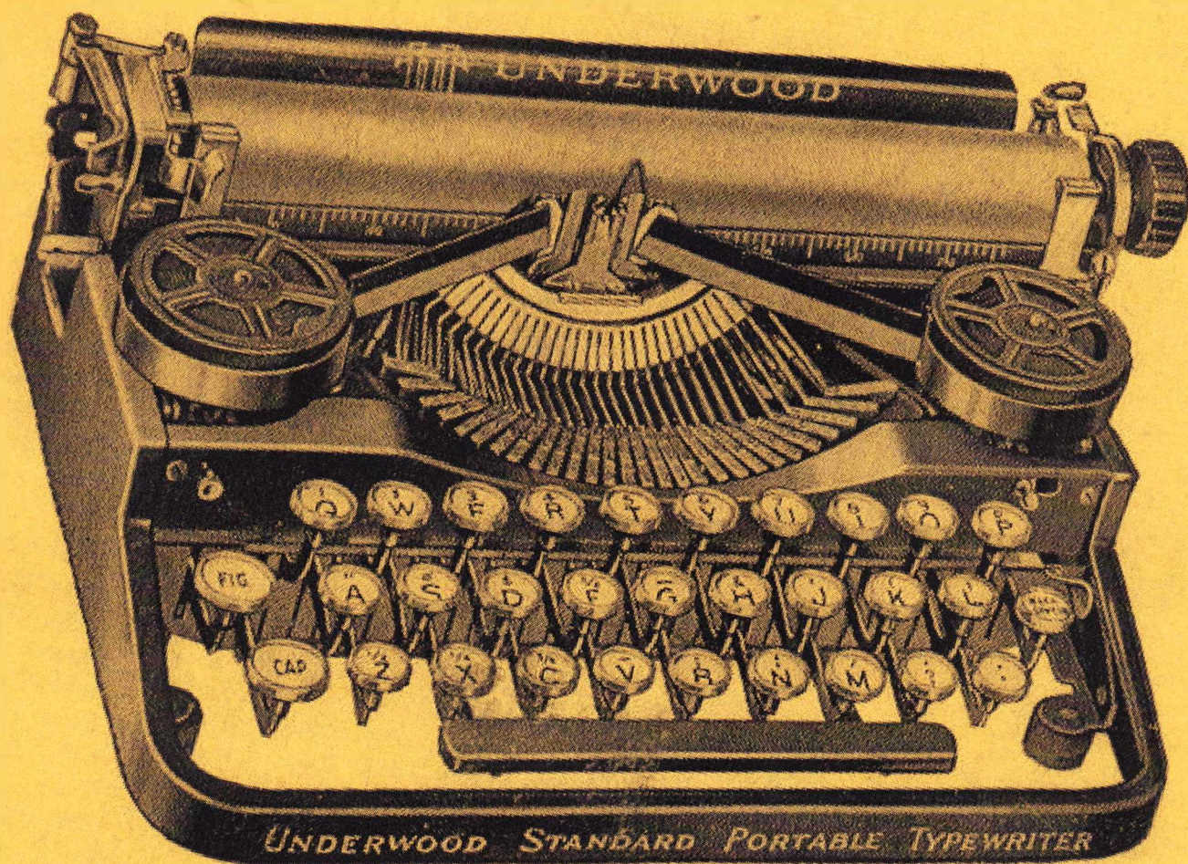
UNDERWOOD STANDARD PORTABLE TYPEWRITER